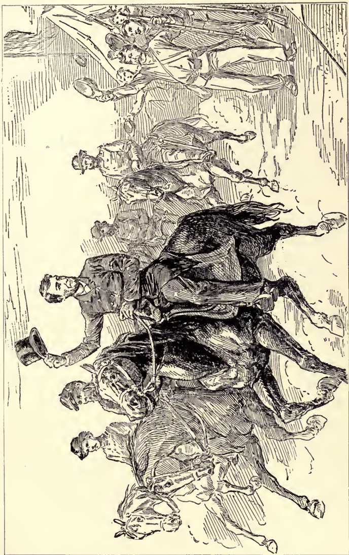
LINCOLN VISITING THE ARMY.